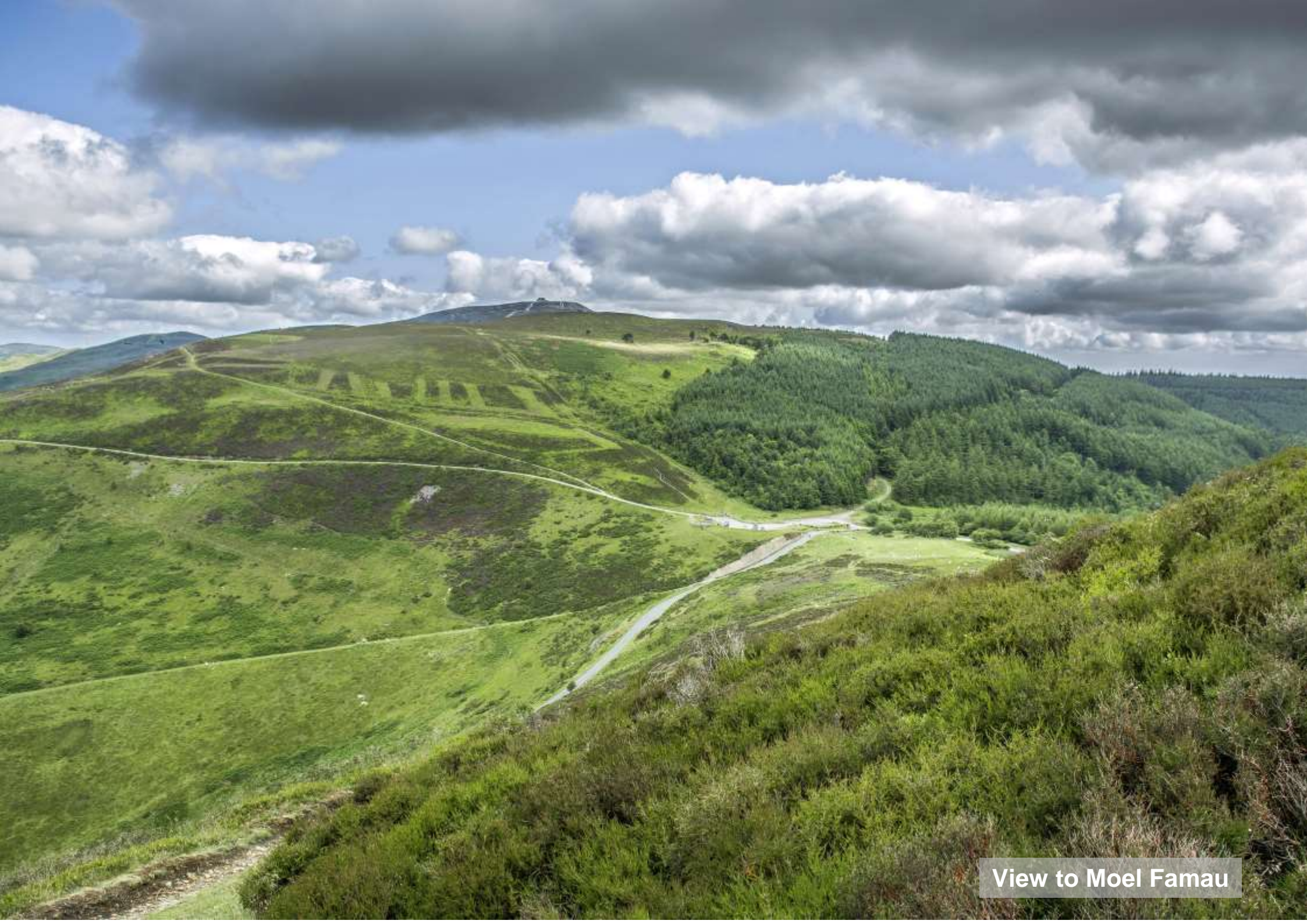
View to Moel Famau