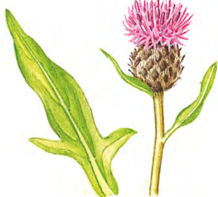
Common knapweed Centaurea nigra