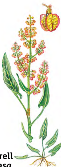
Common sorrell Rumex acetosa