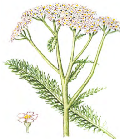
Yarrow Achillea millefolium