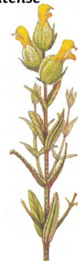
Yellow rattle Rhinanthus minor