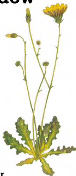
Cat's-ear Hypochaeris radicata