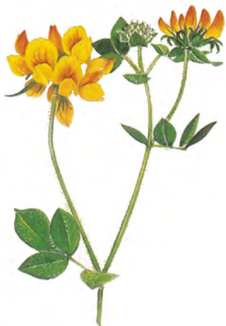
Bird's-foot trefoil Lotus corniculatus