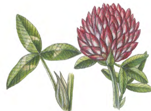
Red clover Trifolium pratense