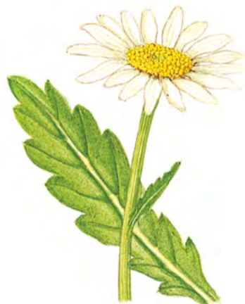
Oxeye daisy Leucanthemum vulgare